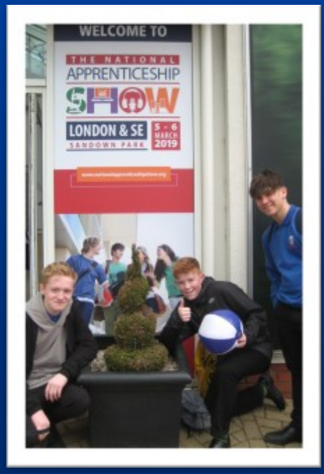
Students from KS4 & 5 travelled to the National Apprenticeship Show on 6th March to talk to over 50 companies about what is on offer