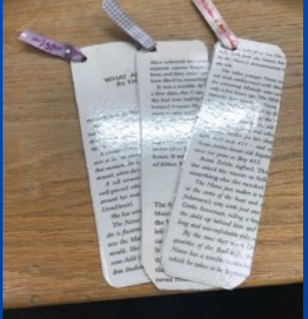
The KS4 library monitors have been busy during lunchtimes making bookmarks, hedgehogs and more.